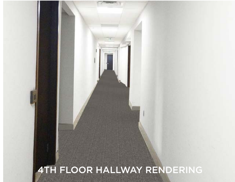
4TH FLOOR HALLWAY RENDERING