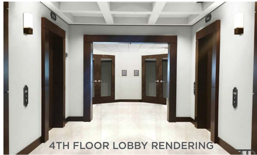
4TH FLOOR LOBBY RENDERING