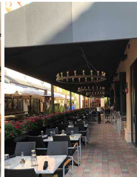
LOCH BAR MIZNER PARKS NEWEST RESTAURANT